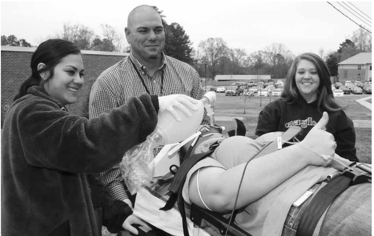
Emergency Medical Technician

NOTE: Students must pass the final comprehensive exam in order to successfully complete the course.