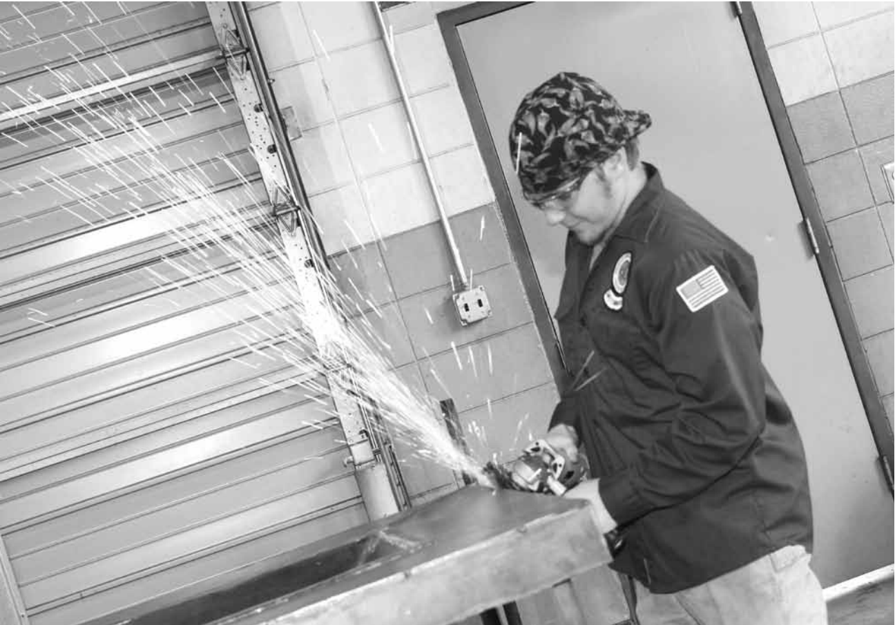
Welding & Cutting

Technical Electives (WBL-1913, WBL-1923, WBL-2913, & WBL-2923)