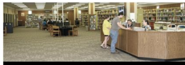
Mamie Ethel Burton Library